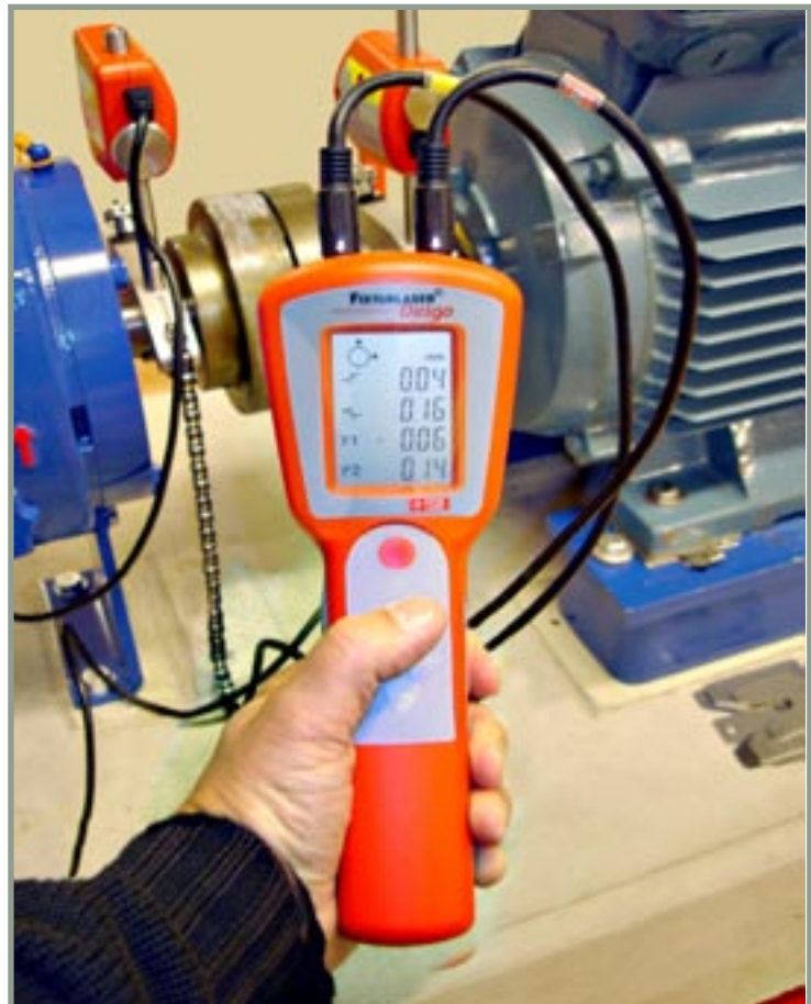
With Fixturlaser Dirigo you get the alignment result after just 3 pushed buttons.

The Fixturlaser Dirigo features a unique "laser line" instead of the traditional laser dot. This makes setup and alignment much easier, as the line is wide and is easily projected to the laser detector.